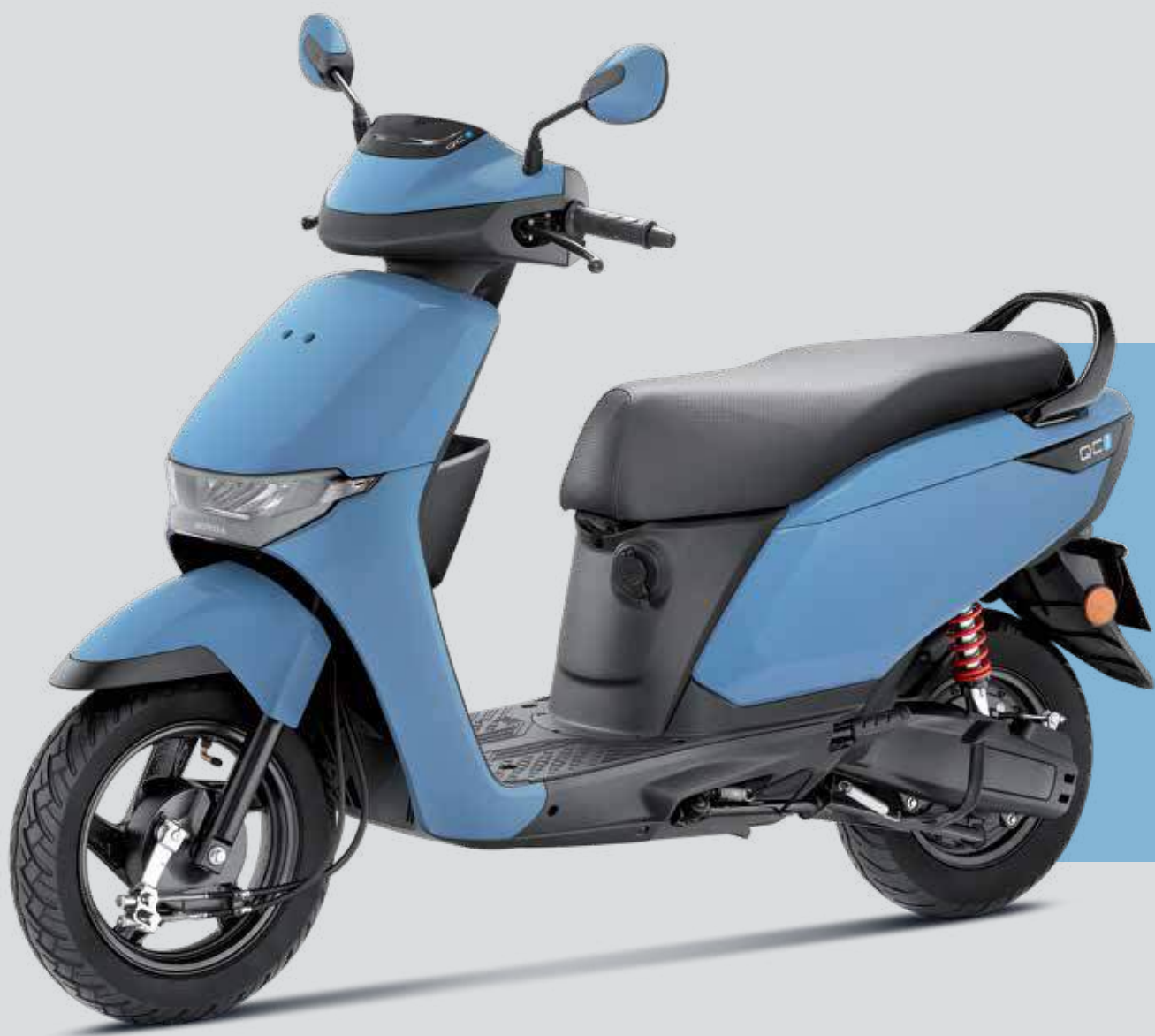
Pearl Serenity Blue

Choose from a range of stunning colours that reflect your personality.