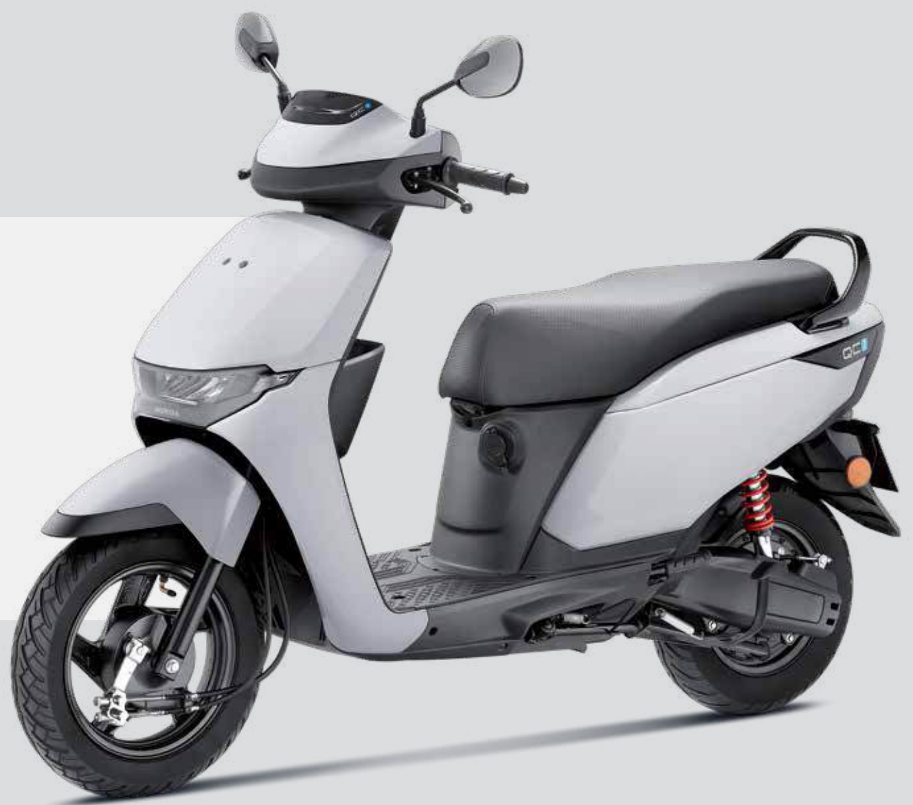
Pearl Misty White