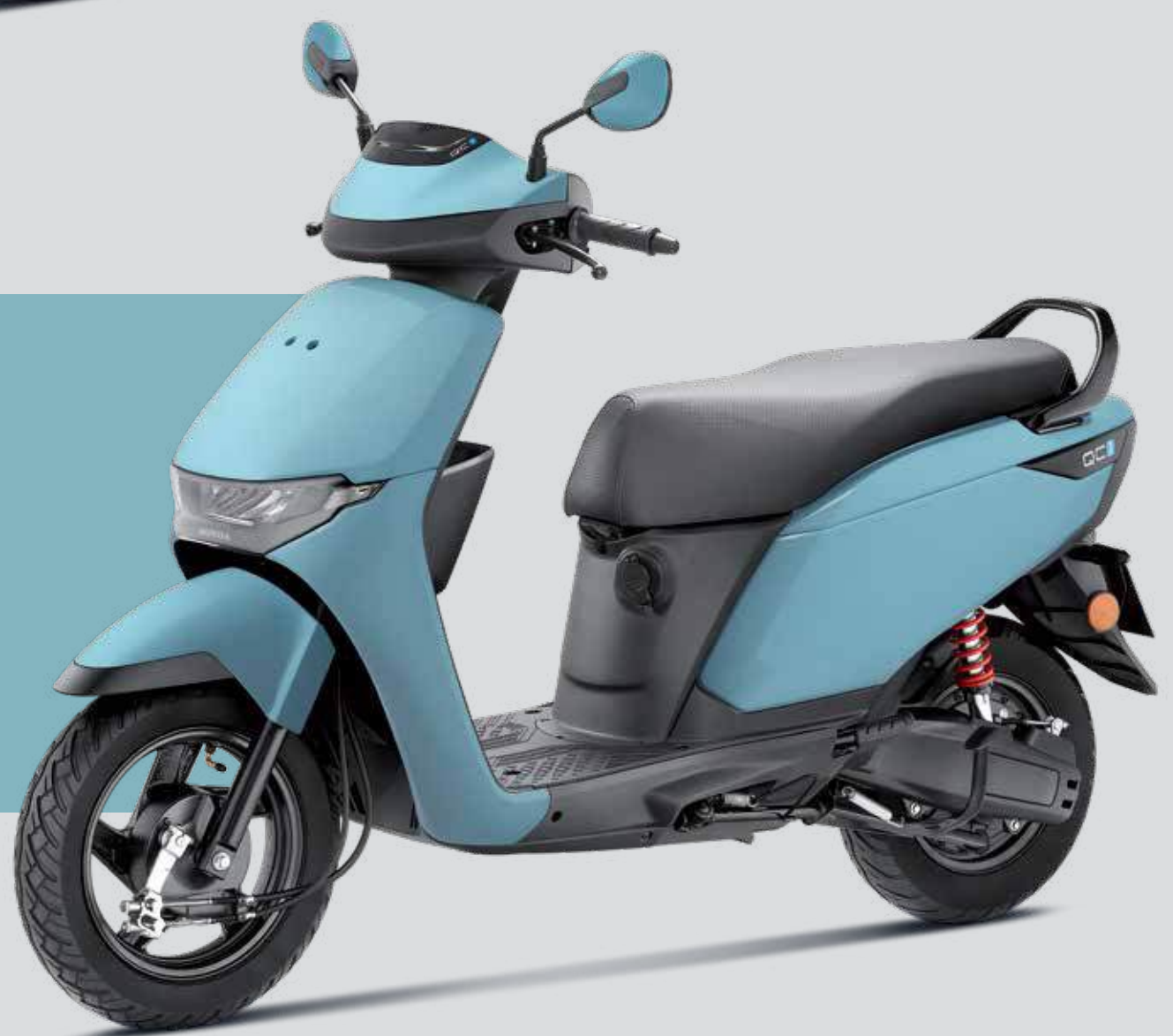
Pearl Shallow Blue