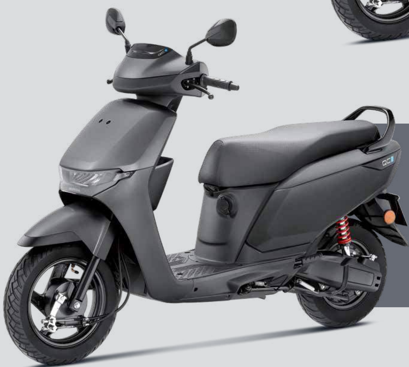
Matt Foggy Silver Metallic

*Products shown in the pictures may vary from actual products available in the market. All features and colours may not be a part of all variants. Accessories shown in the pictures are not a part of standard equipment. For creative visualisation only.